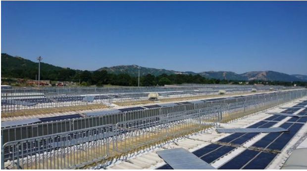
Status before the intervention