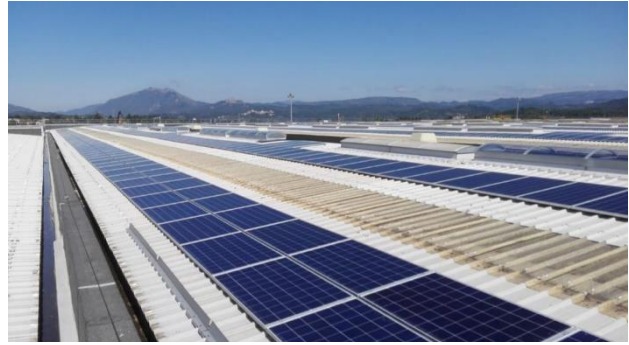
Status after the PV Modules substitution